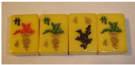
Examples of Vintage Flower Tiles

There are eight flowers. The newer sets depict the seasons and have numbers in the corner. The older sets often have pictures of flowers and people. The numbers and or seasons are irrelevant. Flowers are the only tiles that "match each other" without looking identical.